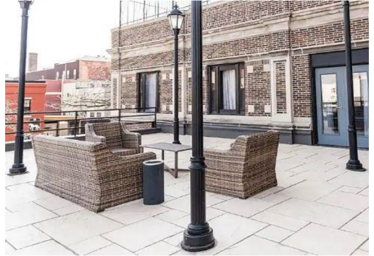
Outside Terrace Area (connects with the Lake)